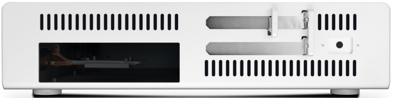
REAR ANGLED VIEW