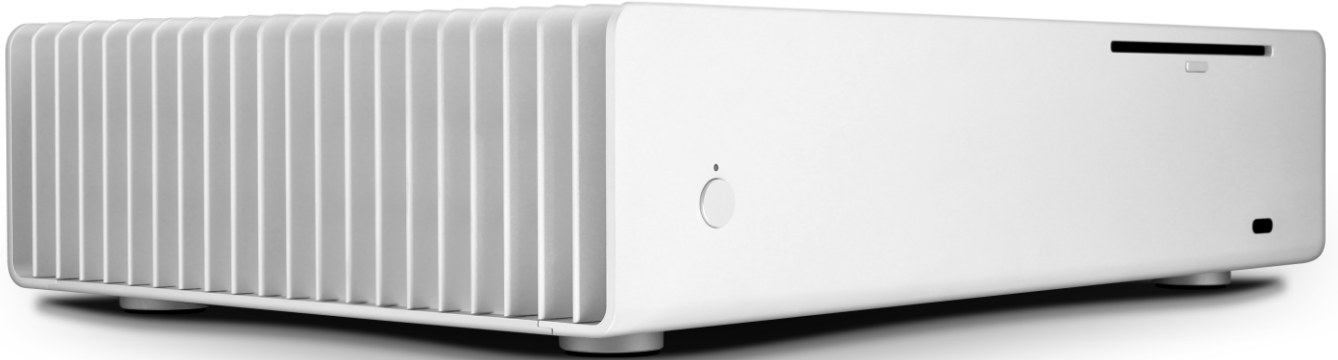
FRONT ANGLED VIEW