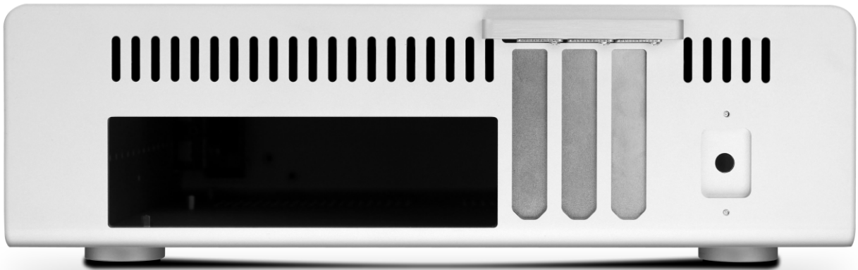
REAR ANGLED VIEW