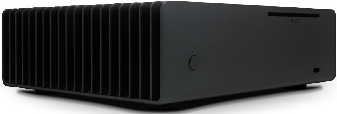
FRONT ANGLED VIEW